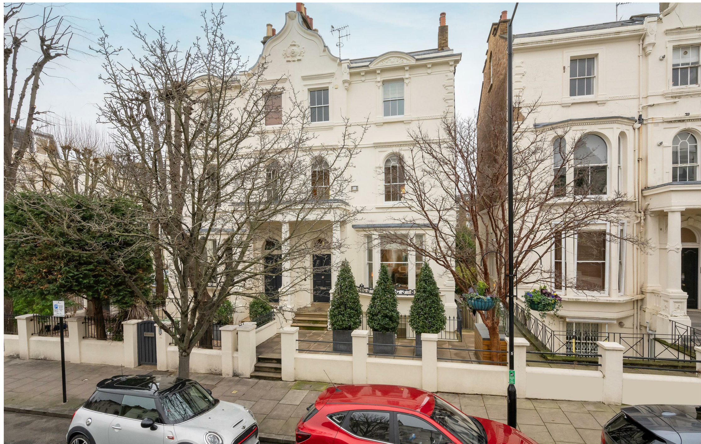
3 Randolph Road, Little Venice London W9 1AN Asking price £7,695,000 Freehold